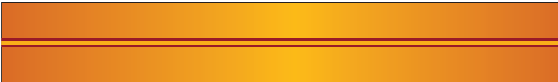
Left Extension for Crown